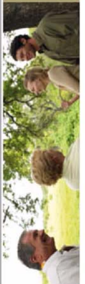
DOWNER SITE - BLOCK 4, SECTION 61