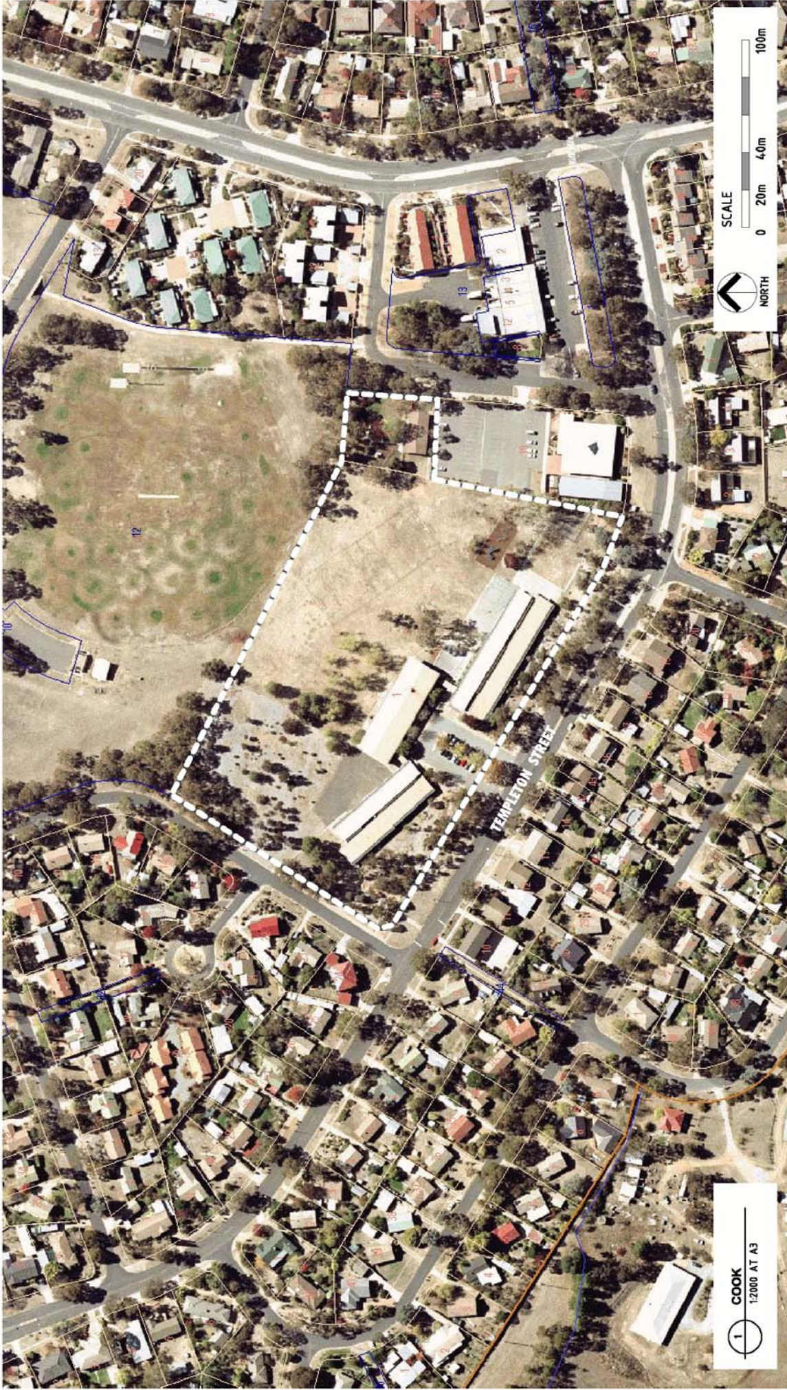
COOK SITE - BLOCK 1+3, SECTION 13